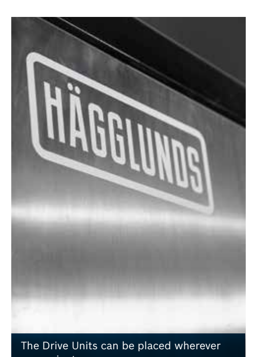
are completely horizontal. And they

look great!" The feed system was designed by